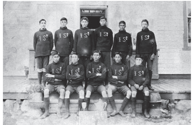
Figure 2. “Battleford Industrial School football team”, 1897.

If one counterpoints the two group portraits, a consoling singularity of view becomes more obviously unwarranted, and a more unsettling articulation of place and education asserts itself. It produces a new mapping of difference, of the mutually imbricated histories of colonialism and its contemporary legacies. If we use montage as a tool of cultural analysis for these photographs, we encounter a representation of educational place as profoundly organised by racial, class and gender boundaries. It is a neo-colonial educational system constituted by the social and spatial apartheid so deeply etched into the culture of the British Empire. This visually mediated place remains a public secret in Saskatchewan’s glorified centenary year, telling a story that can and must be interrupted and changed. As Taussig (2002, p. 338) notes, a public secret involves a practice “of knowing what not to know”, an ongoing performance of repression and expression, that is at the very basis