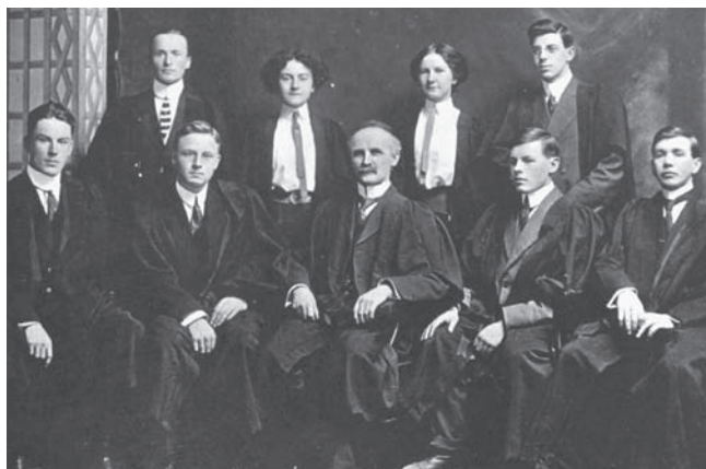
Figure 1. “First graduating class, May 1912”, University of Saskatchewan.

locations in which we are animating the Indigenous humanities will help readers to meet the challenges they themselves face as educators, learners, scholars, activists.