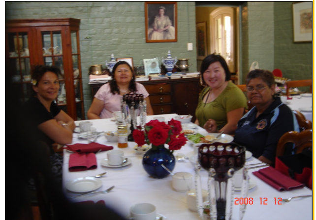
Breakfast in the Outback—Bourke, Australia