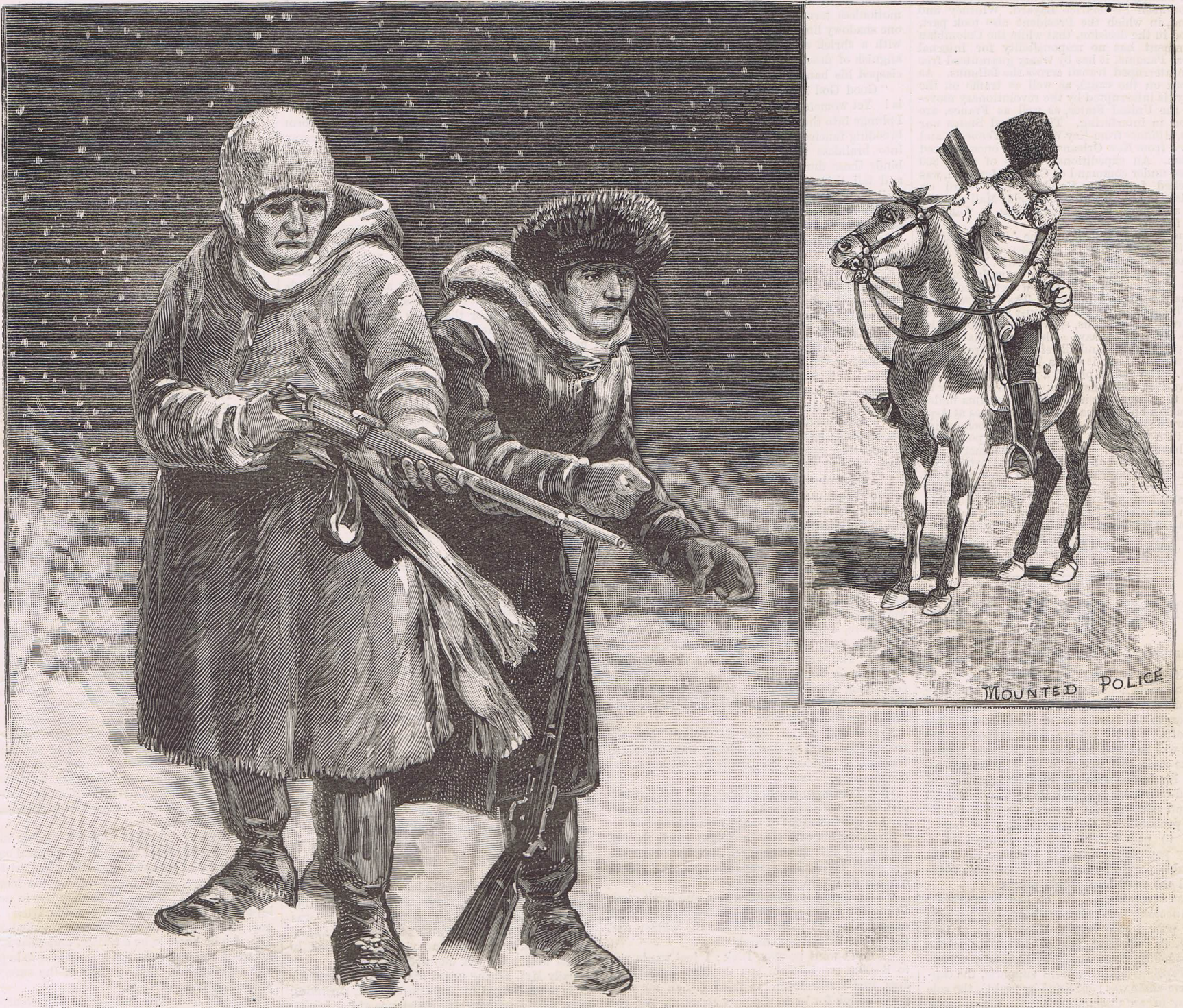
THE RIEL INSURRECTION IN CANADA.—HALF-BREED INSURGENTS ON PICKET DUTY. SEE PAGE 131.