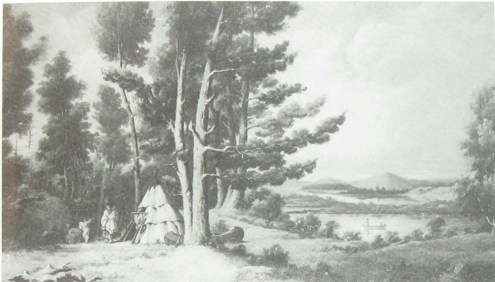
Plate 3: "Ojibbeway Camp on Spider Island," by Paul Kane. Southeastern Ojibwa near the mouth of Manitowaning Bay, Manitoulin Island (the La Cloche Mountains are in the background). Kane's 1845 trip. Oil on board. [Royal Ontario Museum, Department of Ethnology, 912.1.3]