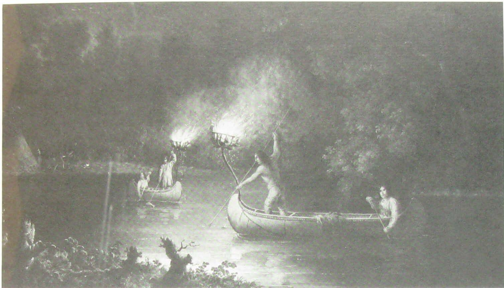
Plate 1: "Spearing Salmon by Torchlight," by Paul Kane. Menominee on the Fox River that empties into Green Bay, Lake Michigan. Kane's 1845 trip. Oil on canvas. [Royal Ontario Museum, Department of Ethnology, 912.1.10]