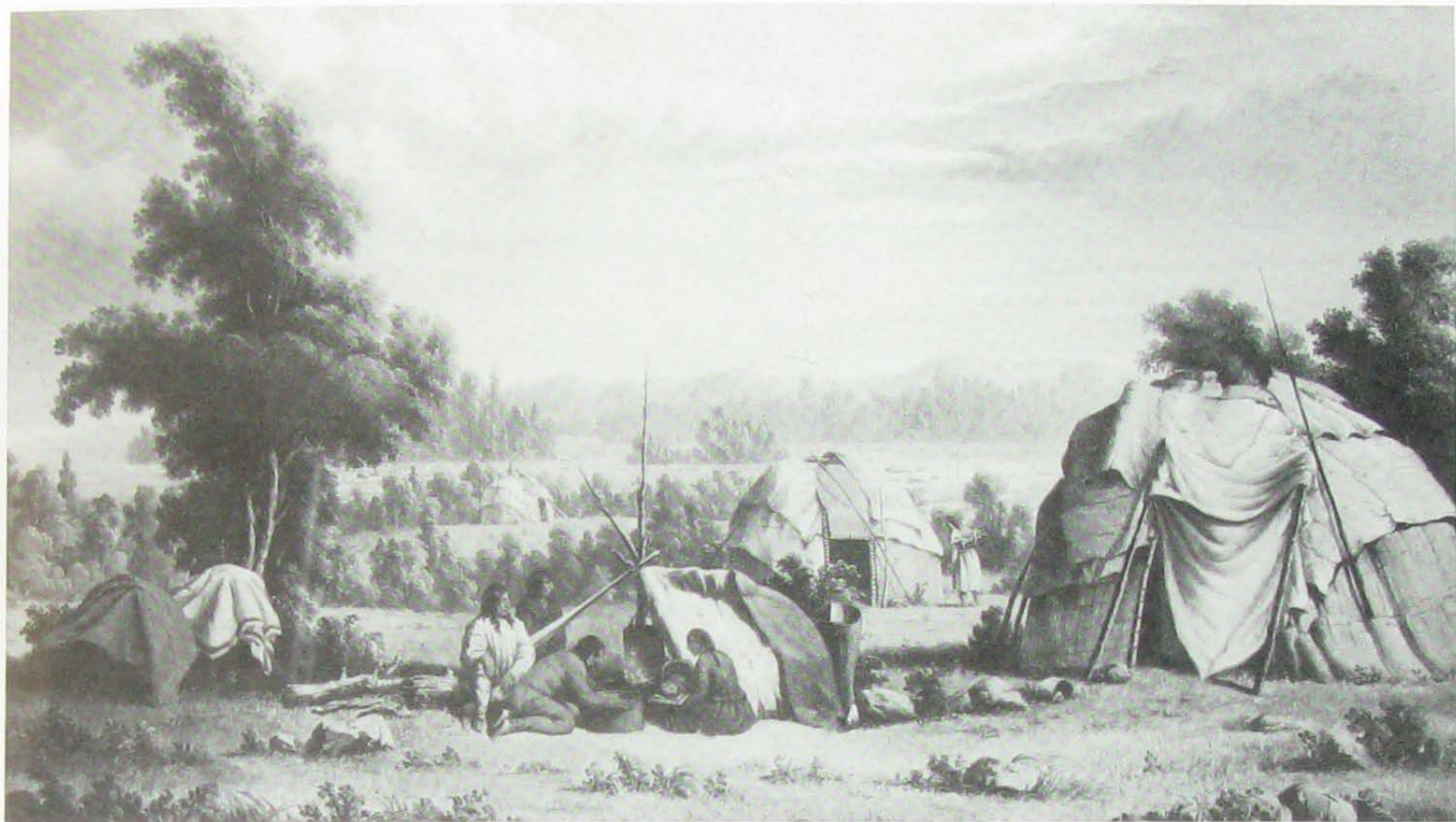
Plate 5: "Sault Ste. Marie," by Paul Kane. Ottawa and Chippewa at Sault Ste. Marie from the American side. Kane's 1846 trip. Oil on canvas. [Royal Ontario Museum, Department of Ethnology, 912.1.9]