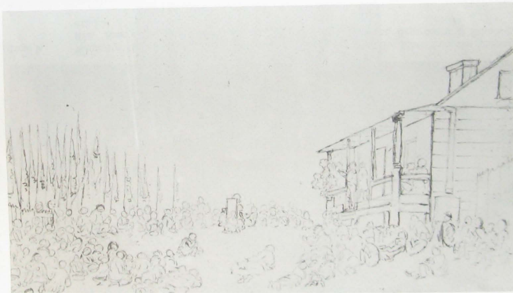
Plate 4: "Indians Assembled at Manitowaning for Treaty Presents," by Paul Kane. Southeastern Ojibwa and Ottawa at Manitowaning, Manitoulin Island. Kane's 1845 trip. Pencil on paper. [Royal Ontario Museum, Department of Ethnology, 946.15.30]