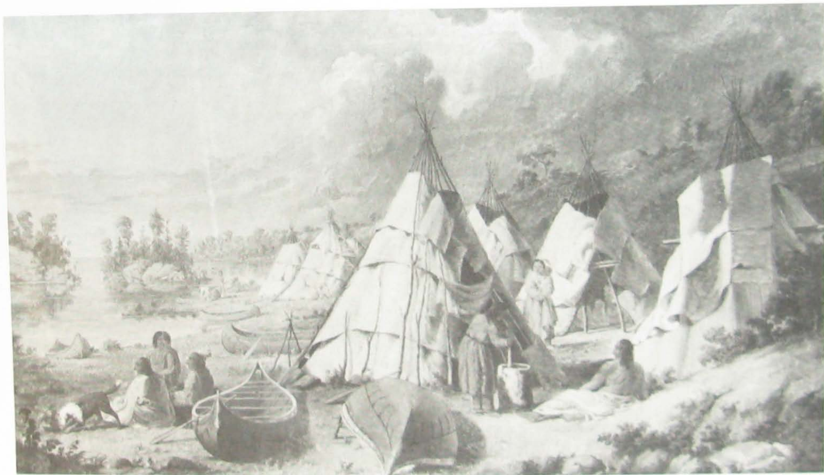
Plate 2: "Encampment among the Islands of Lake Huron," by Paul Kane. Southeastern Ojibwa amongst the islands along the east side of Georgian Bay, south of Manitoulin Island. Kane's 1845 trip. Oil on canvas. [Royal Ontario Museum, Department of Ethnology, 912.1.8]