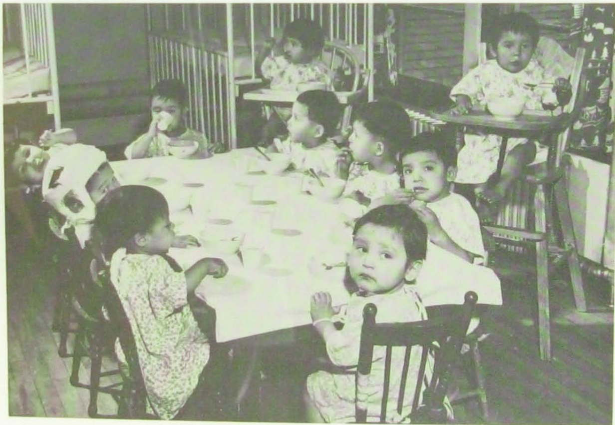
PLATE 7 Lunchtime in the Pediatrics Ward of the Charles Camsell Indian Hospital, Edmonton, Alberta, ca. 1955- 1960.