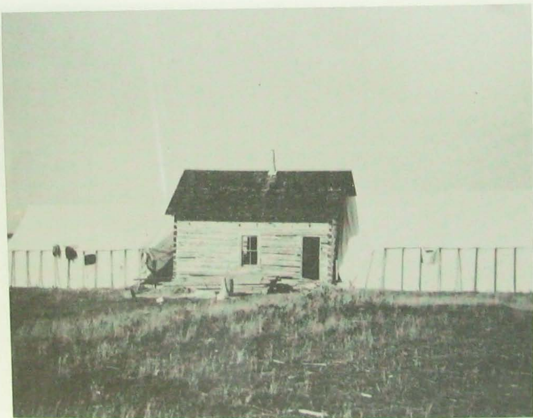
PLATE 2 Dr. Dent's "Hospital" ca. 1909, Rossville (Norway House, Manitoba).