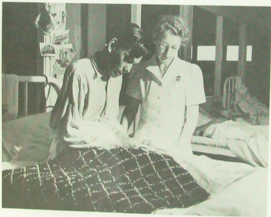
PLATE 5 Occupational therapist instructing patient in rugmaking at the Charles Camsell Indian Hospital, Edmonton, Alberta, ca. 1955-1960.