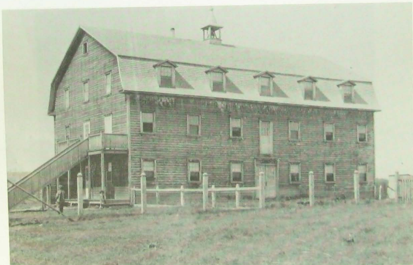
PLATE 3 Roman Catholic Hospital and Chapel, Fort Simpson, NWT, June 24, 1921 [O.S. Finnie/Indian and Northern Affairs Collection, National Archives of Canada/PA-100298].