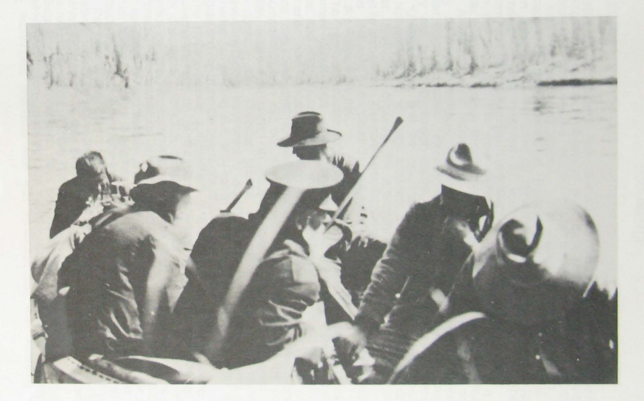
PLATE 11 Commissioner Semmens meets the Governor General Earl Grey while ascending the Hayes River, August, 1910.