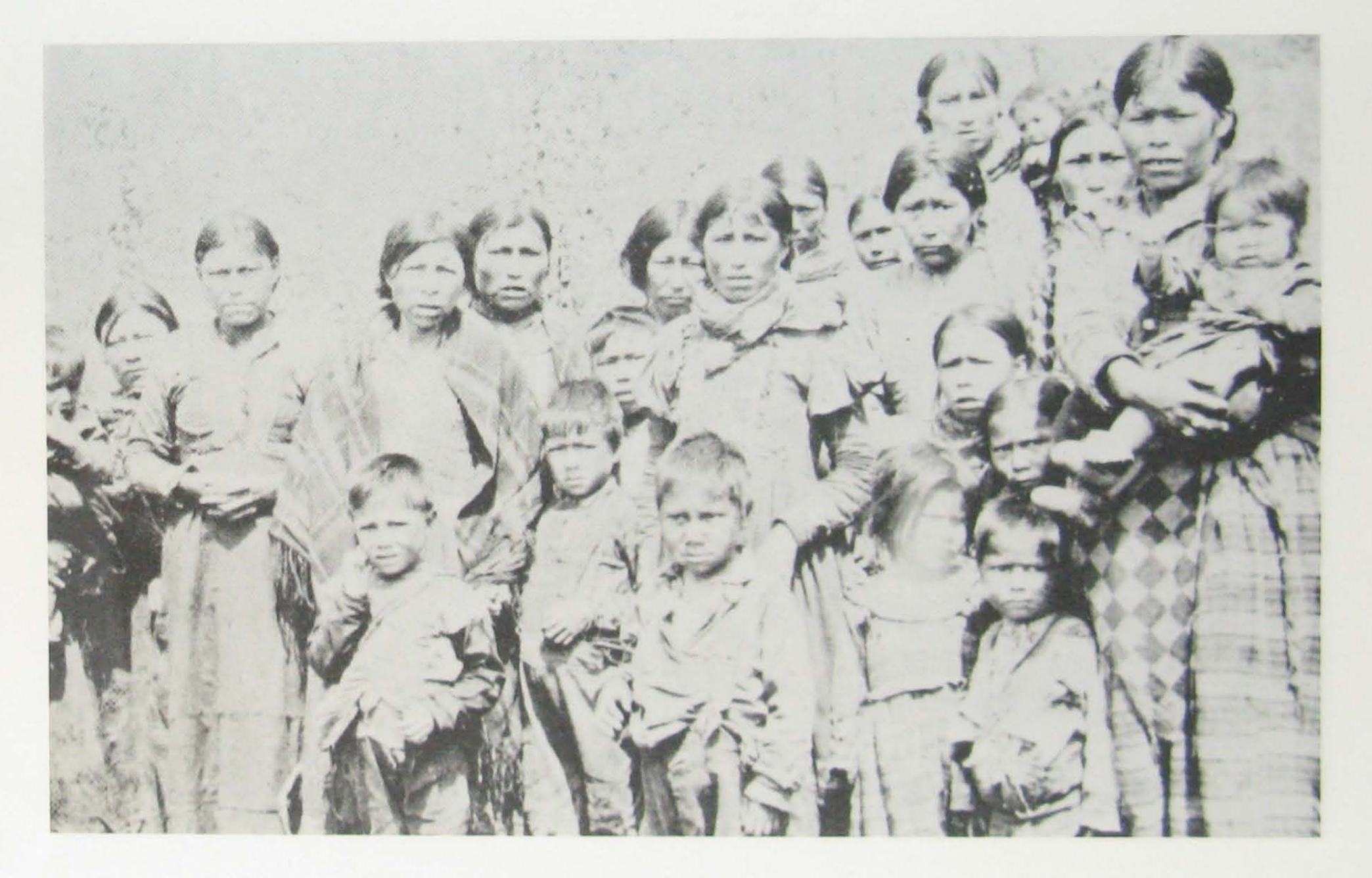
PLATE 6 Women and children of Deers Lake Band, June, 1910.