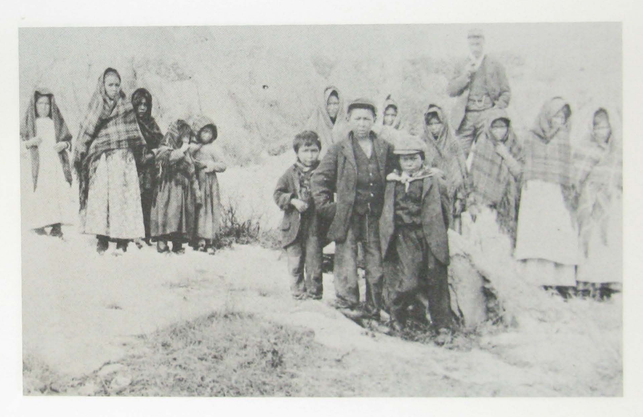
PLATE 8 School children at Fort Churchill, August 1910.