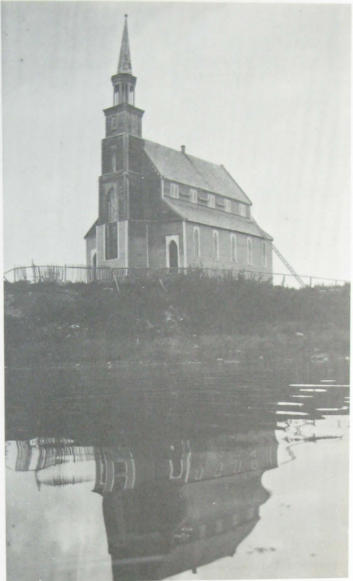
PLATE 1: Stanley Mission Church. This is the original steeple in 1919. Later it was considered unsafe and a new one was put up. [Saskatchewan Archives Board]

Bateman/McKay Photo Collection: Trip to LaRonge, Saskatchewan, 1919