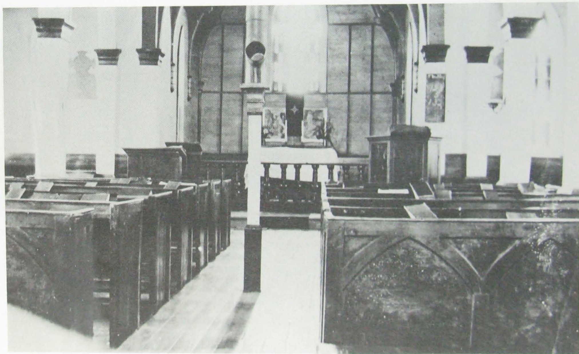
PLATE 4: Interior of Stanley Mission Church to alter.