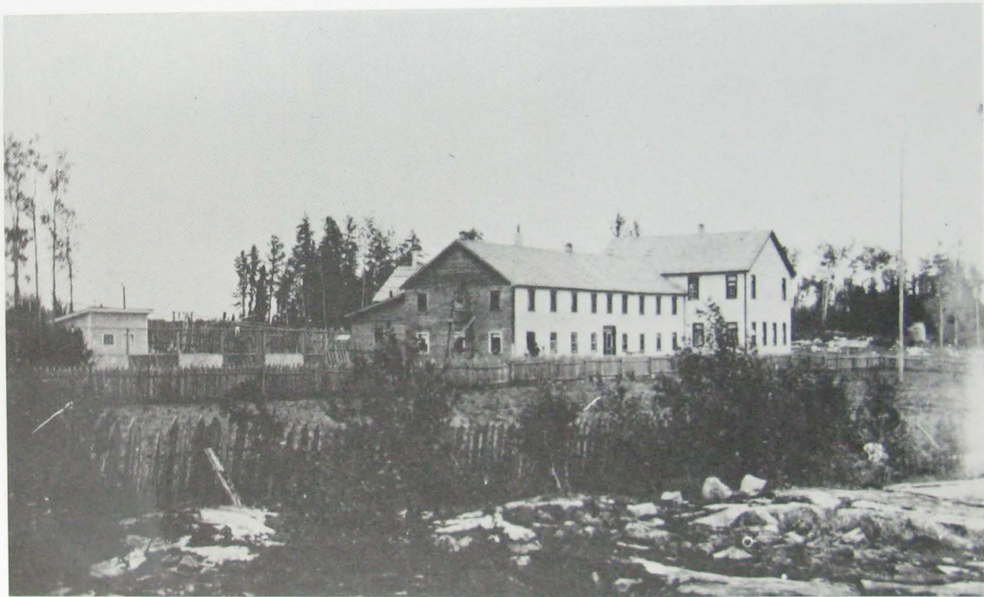
PLATE 3: Old Wooden Anglican Mission School in August 1919. This was destroyed in March 1920 and a new one built.