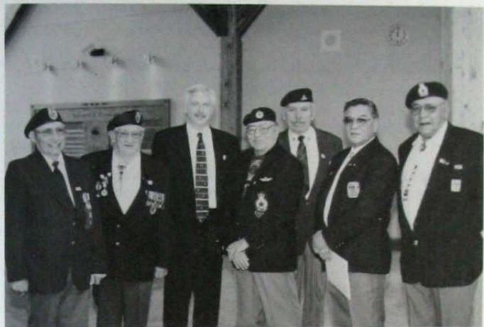
Photo 9. Commissioner Arnot with Saskatchewan Indian Veterans at Treaty Awareness Days.