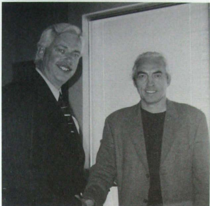
Plate 3. In August 1997, the OTC hosted meetings at Wanuskewin Heritage Park, just outside Saskatoon, Saskatchewan. Pictured here are Commissioner Arnot and Phil Fontaine, recently elected Grand Chief of the Assembly of First Nations.